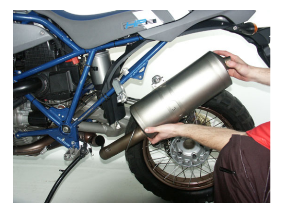
Figure 3 Figure 3a

For R 1200 GS model: unscrew the bolt of the heat shield from the link pipe and remove the heat shield (Figure 4).