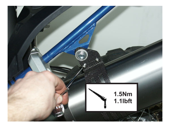
Figure 11 Figure 11a

8. For R 1200 GS & HP2 model: check the position of the Akrapovic Slip-on system. Make sure the muffler is not touching other parts of the motorcycle.