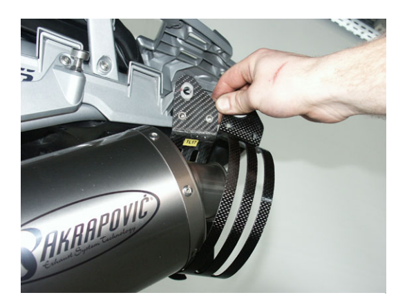
Figure 10 Figure 10a

6. For R 1200 GS & HP2 model: correctly position the carbon-fiber clamp and slide it onto the muffler, bear in mind the right offset of the carbon-fiber clamp viewed from the rear <u>WARNING!</u> open the clamp to slightly wider than the diameter of the outer sleeve of the muffler – do not scrape it along the muffler outer sleeve! (Figure 10, 10a).